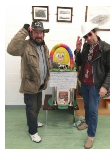
Cowboys at Brookvale?

Many Carers will be supporting a loved one and will not think of themselves as being a carer. 1 in 8 adults provide unpaid care for family and friends, whether round-the-clock or for a few hours a week. Caring is important but it can be tough. As a patient group we recognise the vital role that carers have and want to ensure they receive the right level of support they need to continue to care. We have produced a comprehensive summary of support available and have highlighted our Top Tips, amongst which are how to get a Needs Assessment for the carer and the cared for person and who the carer should register with for extra support when they need it. Visit 'Carers Advice' from our Self Help index on the PPG website and our Health And Wellbeing Self Help resource Helpline: 0808 2787987 .