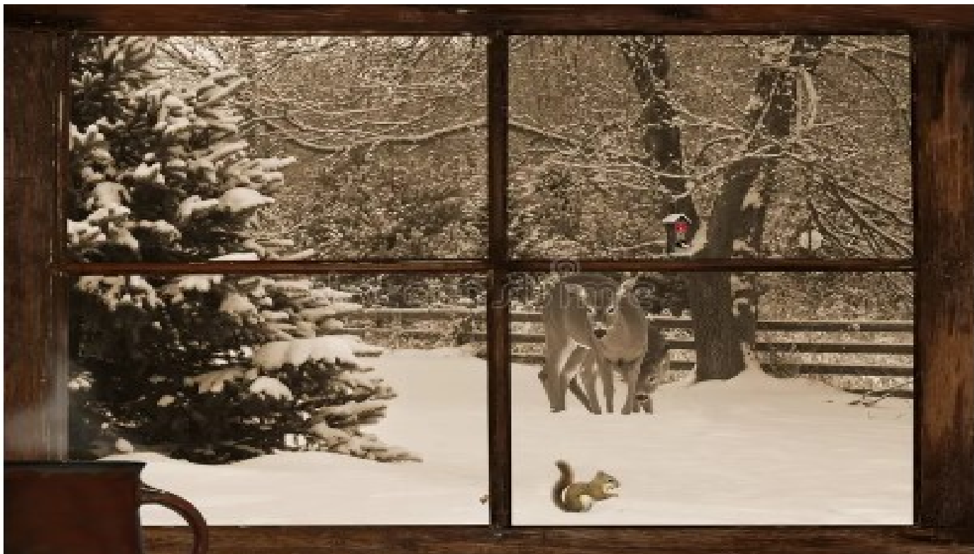
Christmas Card Design, Courtesy of : Christmas Card Scene Stock Photos - Free & Royalty-Free Stock Photos from Dreamstime

For all the latest local news , events and information: HeartOfBrookvale www.brookvale.org.uk