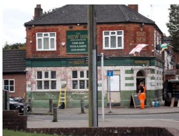
New Inn tiles being cleaned up ☐ ->

https://www.cwgc.org/visit-us/find-cemeteries-memorials/cemetery-details/2067510/basingstoke-worting-road-cemetery/