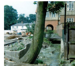
Where was/is this?

https://shapingthefuture.commonplace.is/