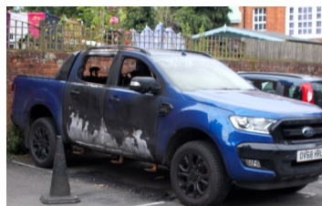
Where not to park!