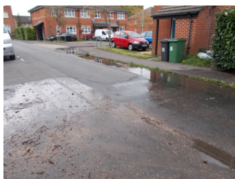
and this was outside Downsland Shops:

This came from the garages at the rear of Solbys Road onto Southend Road: