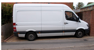
How do they do that?