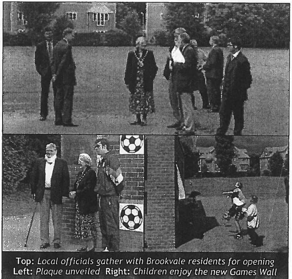
Top: Local officials gather with Brookvale residents for opening Left: Plaque unveiled Right: Children enjoy the new Games Wall

4 Contacts Every contact, organisation and local body you could ever need!