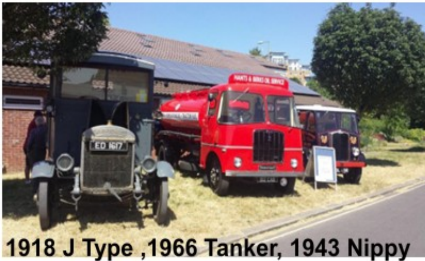
1918 J Type ,1966 Tanker, 1943 Nippy

Midday- 4pm Brookvale Village Hall RG21 7RP