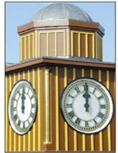
Thornycroft clock, Basingstoke

Find family photos, see transport displays, help raise clock money, learn about Made in Basingstoke, works canteen food, see women's work.